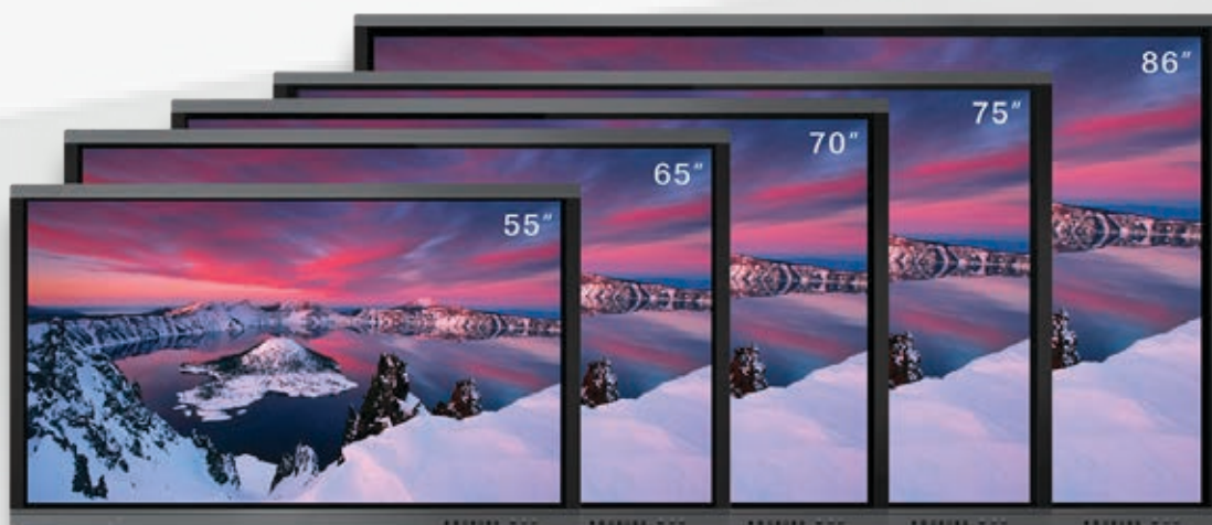
TABELLA Interactive Intelligent Panel

UHD 4K Resolution Model: L55EB, L65EB, L70EB, L75EB, L86EB