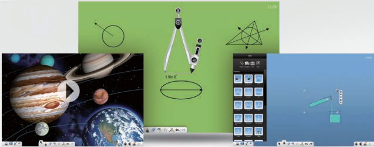
TABELLA works perfectly with latest interactive software tools