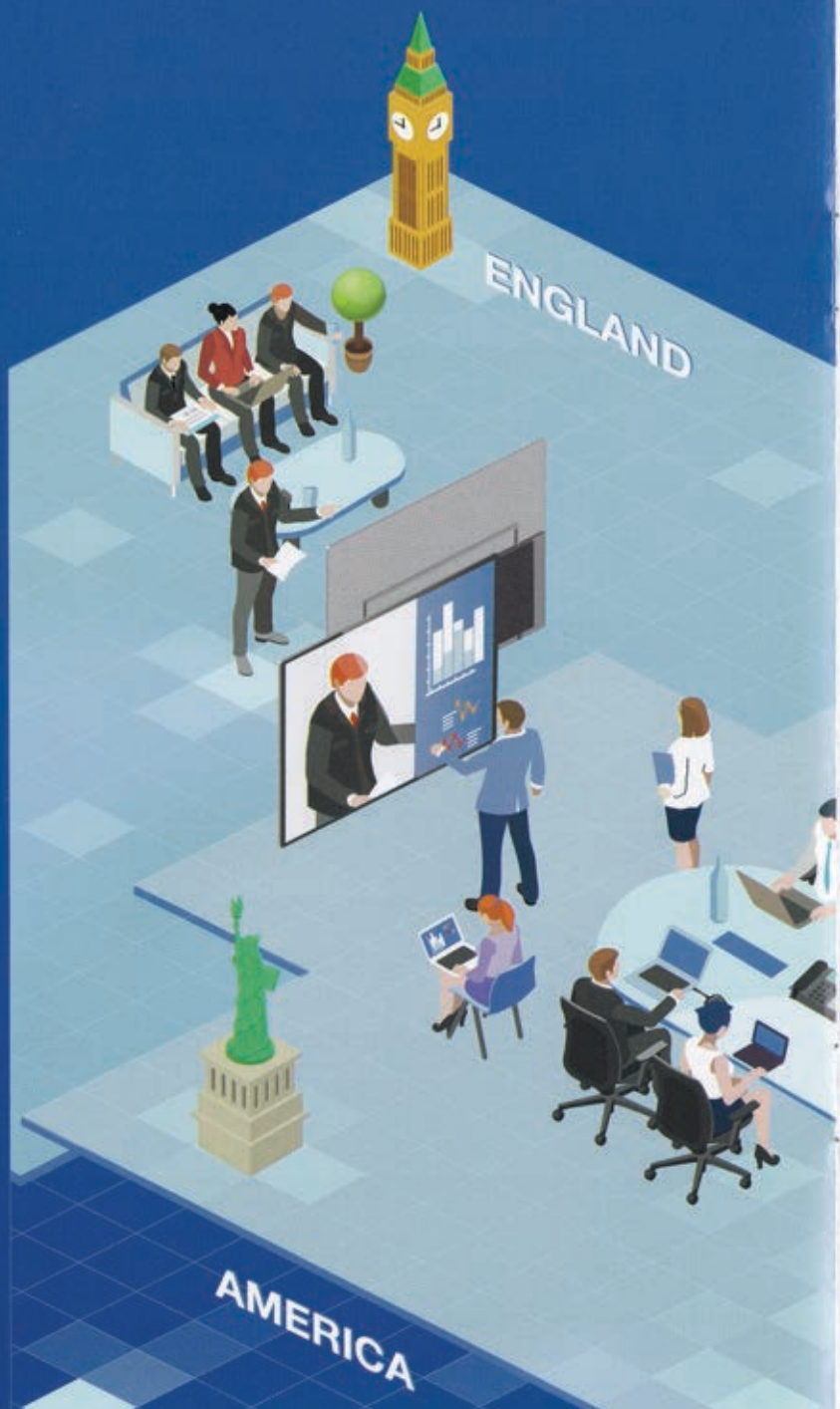
TABELLA is compatible with a variety of remote conference hardware and office applications software.